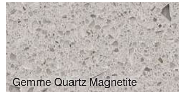
Gemme Quartz Magnetite