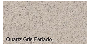
Quartz Gris Perlado